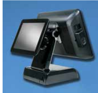
Optional Integrated 9.7" Rear LCD Customer Display