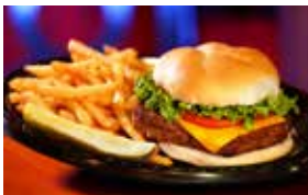
Table Service and Quick Service Restaurants