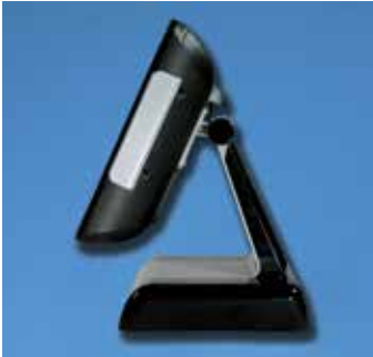
Sleek Cabinet Design