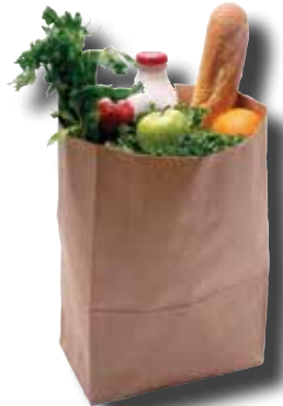
Convenience Stores / Small Grocery Stores