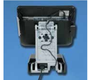
Integrated Power Supply and Cable Management Keeps Cords Hidden and Organized