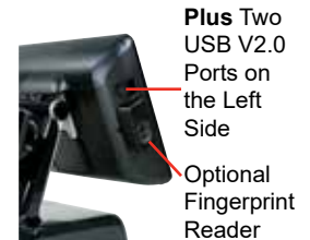
Plus Two USB V2.0 Ports on the Left Side Optional Fingerprint Reader