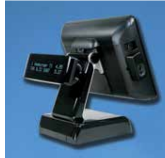
Optional Integrated Rear 2 Lines by 20 Characters VFD Customer Display