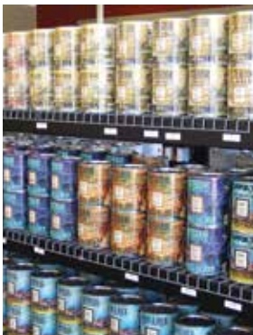
Hardware, Paint or General Retail Stores