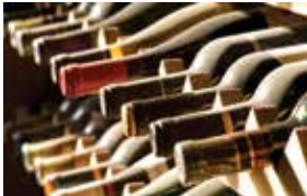
Tobacco Stores / Liquor Stores