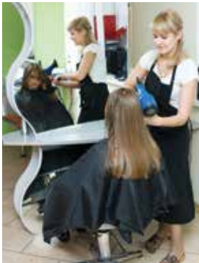
Apparel Stores / Salons