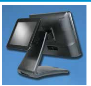
Optional Integrated 9.7" Rear LCD Customer Display