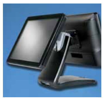
Optional Integrated 15" Rear LCD Customer Display