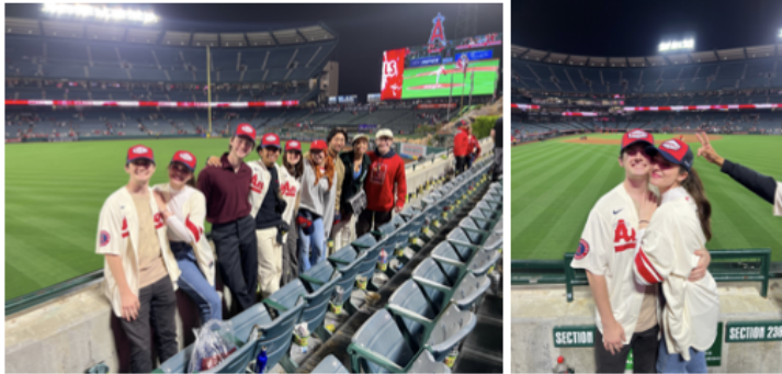
Mike Trout and Ohtani played that night. They won!

We attended an Angels game after living next to their stadium for over a year.