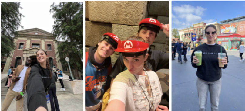
as seen in 'Back to the Future'

Universal Hollywood hosted us for a VIP tour. We got a backstage tour where they showed us different filming locations from some infamous movies.