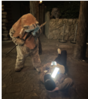
Liam getting a unique angle with an Ewok