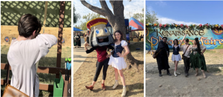
Met Lord Farquaad & drank mead all day. What more can you ask for?

Universal Hollywood hosted us for a VIP tour. We got a backstage tour where they showed us different filming locations from some infamous movies.