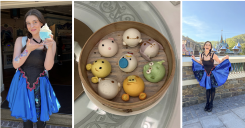
Arendelle food + character dim sum + Taya's Anna-inspired dress