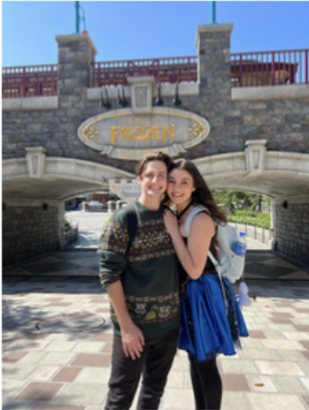
His boss told us "church and state" while we were in Hong Kong — we had to sneak in one picture, though :)