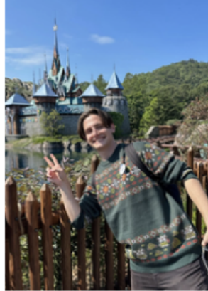
Long nights & early mornings