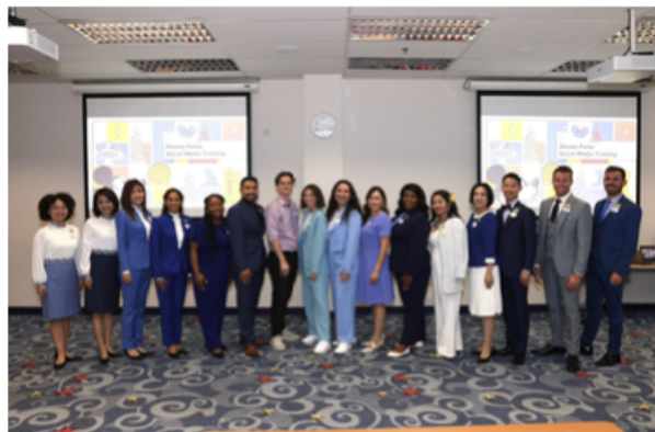
Him and his team educated the new Disney Ambassadors on social media