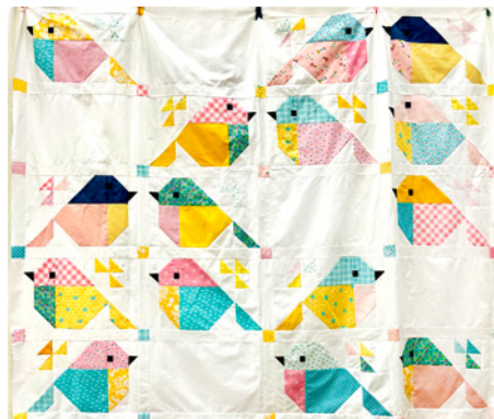
Adorable chickadee pattern from SimplyLovelyThings.com

Here are six items from just 6 of 60 vendors! Like what you see? The vendor contacts are provided below.