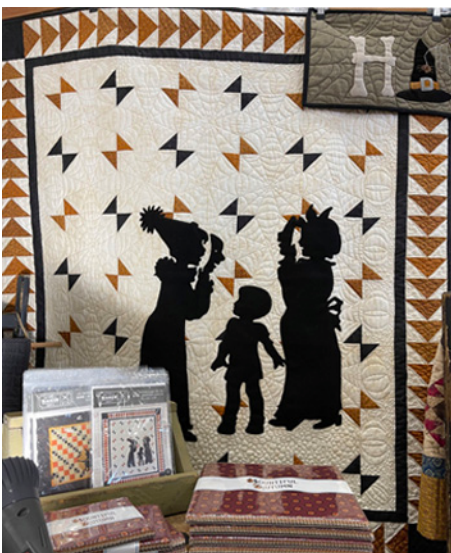
Sweet silhouette pattern from NeffsCountryLoft@gmail.com