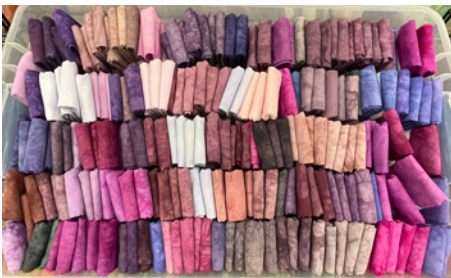
A vast selection of hand-dyes, just one of eight bins shown here, are available from DyeLectable.com