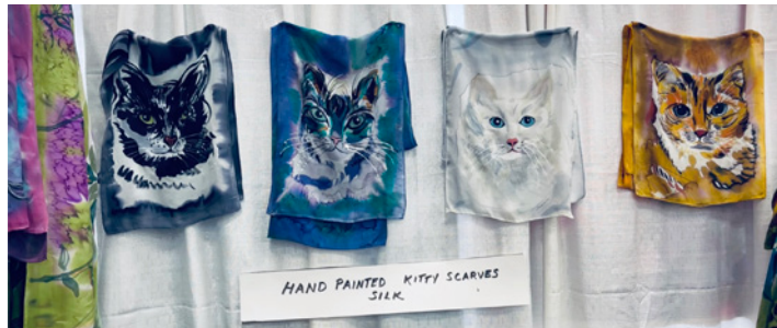
Hand painted kitty scarves silk. Cat, dog & gnome patterns from DiscountSewingCenter.com >