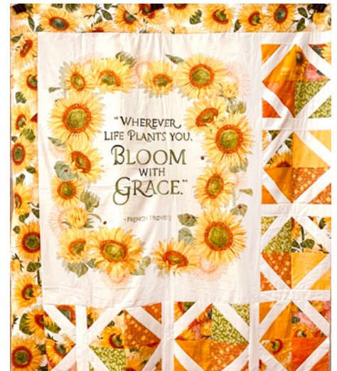
A message with the image - panel from ConcordQuiltingStudio@gmail.com