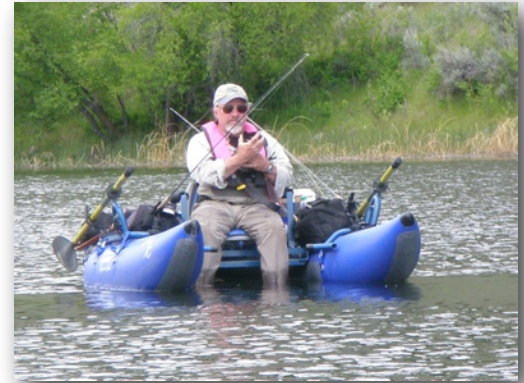
(Is that a cell phone?)