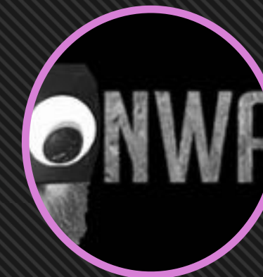
PARZIVAL NINJA VR LEAGUE

SEASON FIVE JANUARY 8TH TO 11TH LAS VEGAS