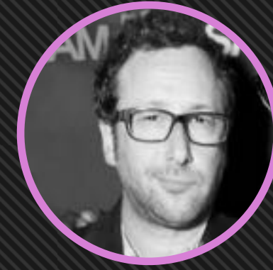
DAVID NUSSBAUM HOLOGRAM USA