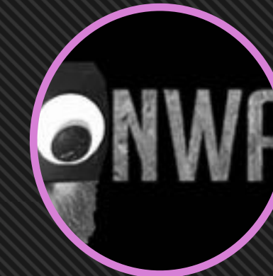
PARZIVAL NINJA VR LEAGUE

SEASON FIVE JANUARY 8TH TO 11TH LAS VEGAS