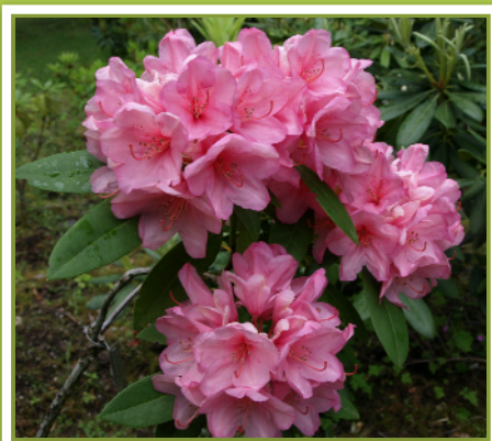
R catawbiense album var. 'Powell Glass' X 'Ditto's Mom'