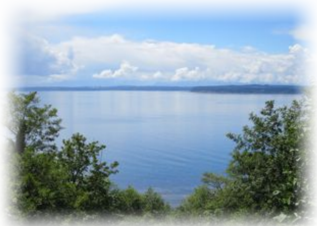
View from the lower part of the Elisabeth Miller Garden