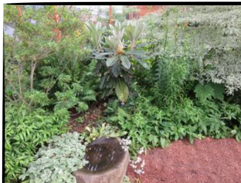
Shade Garden at Far Reaches Farm