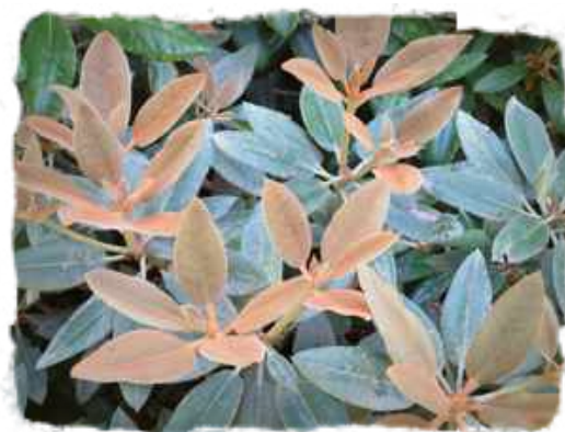
new foliage color in June at Elisabeth Miller Garden

We need someone to coordinate a cookie and coffee team for our meetings. This means making coffee, getting volunteers to bring goodies (cookies, fruit, finger food), and to clean up the kitchen afterwards.