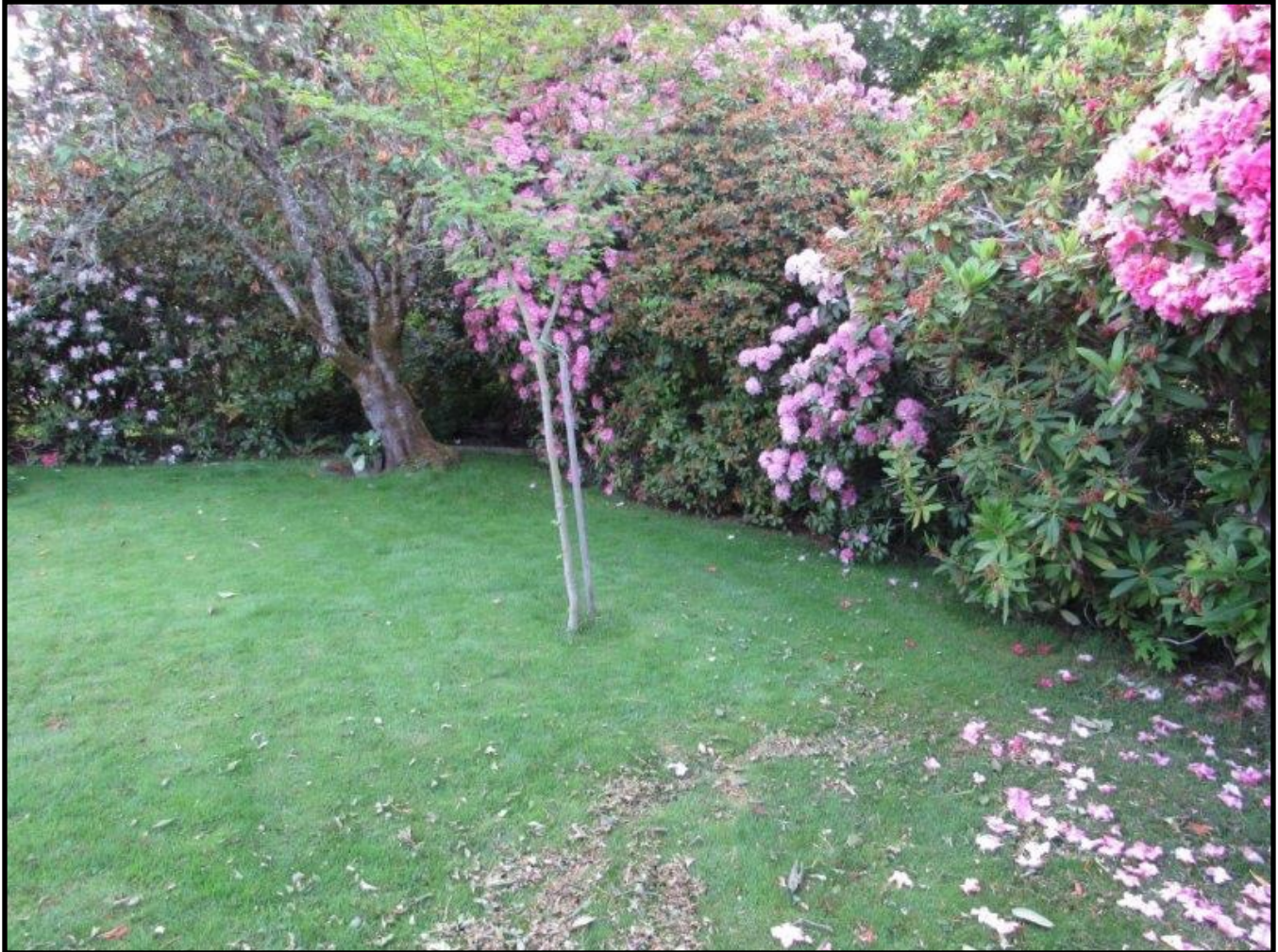
Sarlak garden view