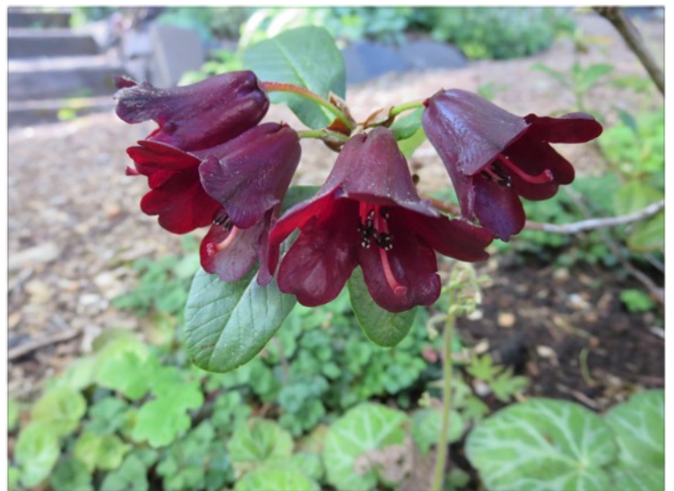
R. sanguinem var. sanguineum Rock #6 in Hewitt garden