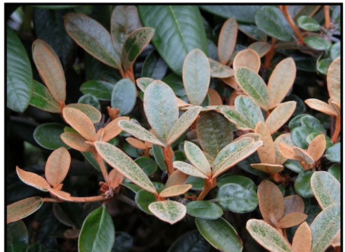
R. tsariense