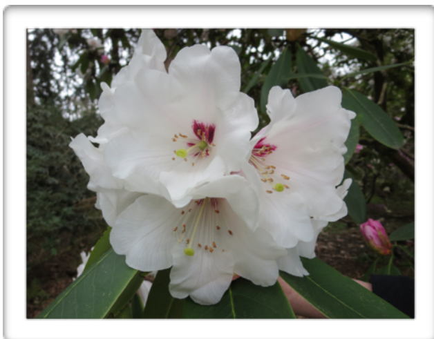
R. 'Avalanche' in Hendricks Park