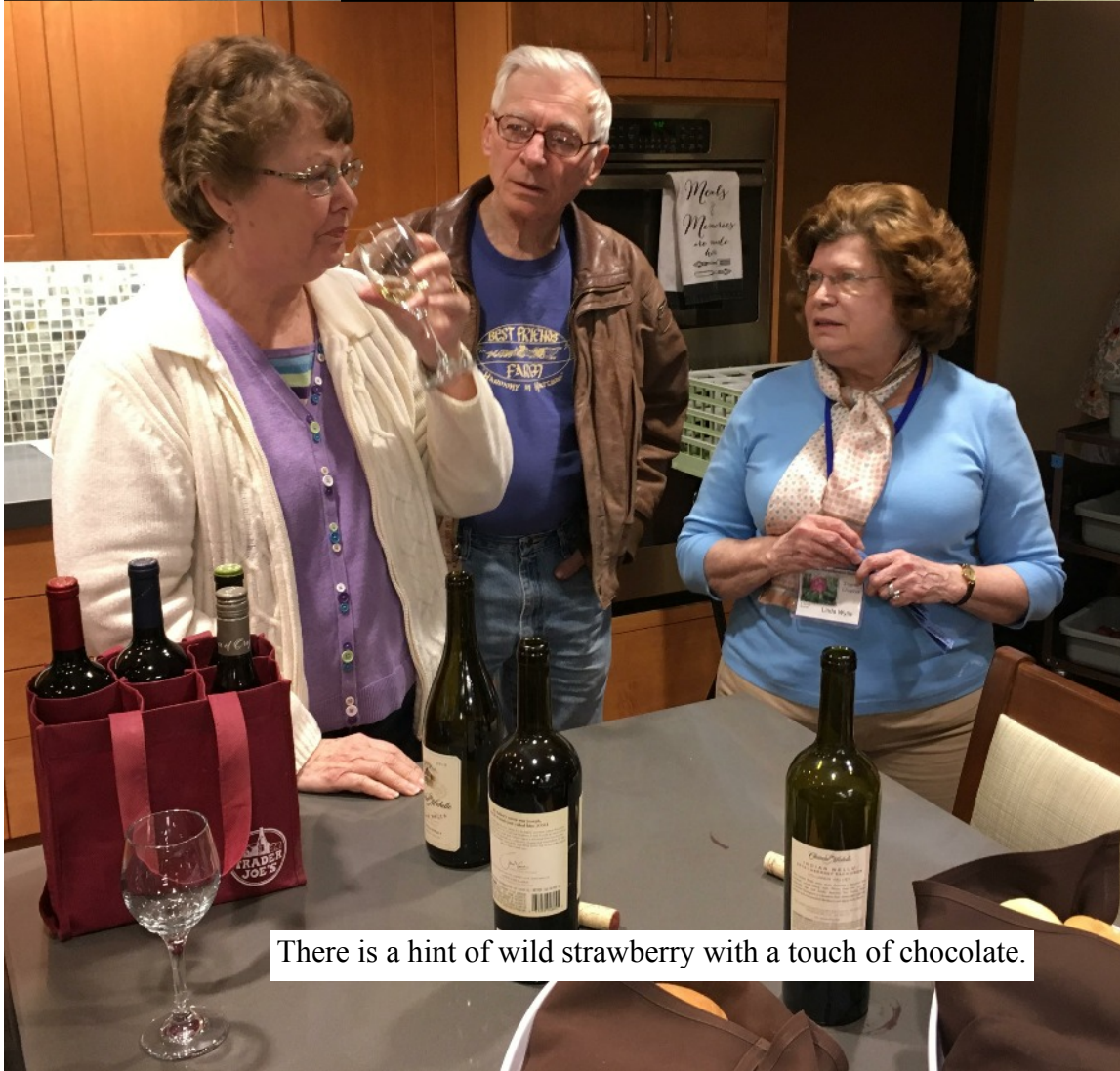
There is a hint of wild strawberry with a touch of chocolate.