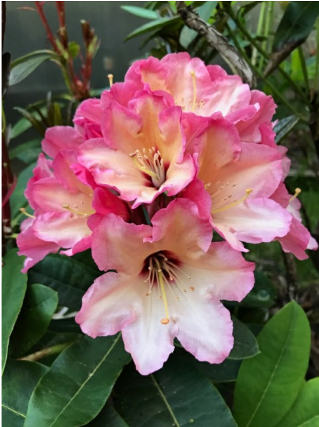
Above and right are a truss and foliage of the same seedling from 'Prism' x 'Tickle.'

When selecting plants, I always try to choose parents that have full trusses. I dislike open tops as it's like a half lax truss crossed with a full truss. Also the color of the flowers is an important part of choosing parents. I like to cross colors. It is fun, because you never know what combination you will get. I would like to see some more members involved in hybridizing. It is fun to exchange ideas. The following photos show some of my efforts.