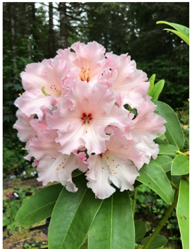
'Kubla Kahn' x 'Tickle'