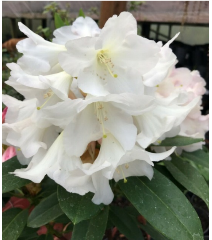
Large white truss from ('Prism' x 'Point Defiance') x 'One Thousand Butterflies'