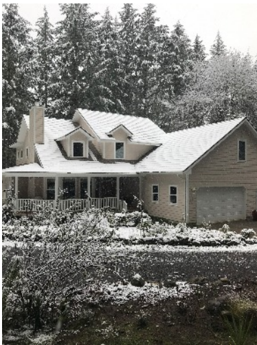
Above (before the snow) and to the left "My big problem." (after the snow storm).

Jack Olson sent me the following pictures and text March 10 th , 2019 after the big storm.