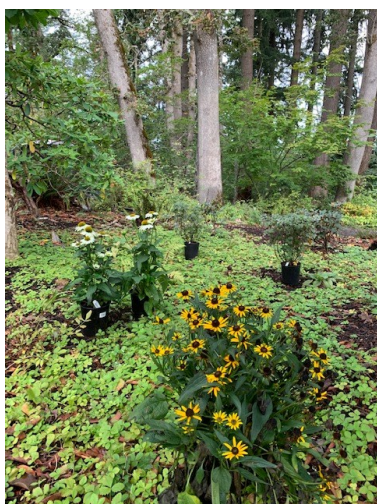
To the left, deer resistant perennials To the right, R. benhallii

This is just the beginning of the wonderful additions to Hendricks Park. Thank you, Eugene voters and the Friends of Hendricks Park.