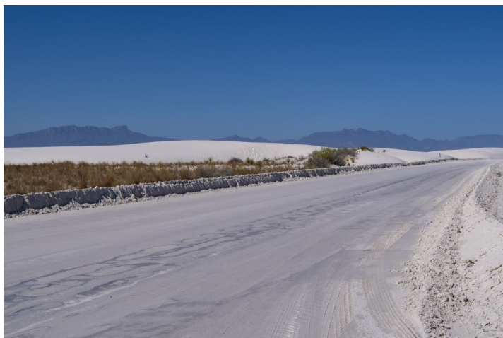
White Sands National Monument, white sand, not snow https://www.nps.gov/whsa/index.htm