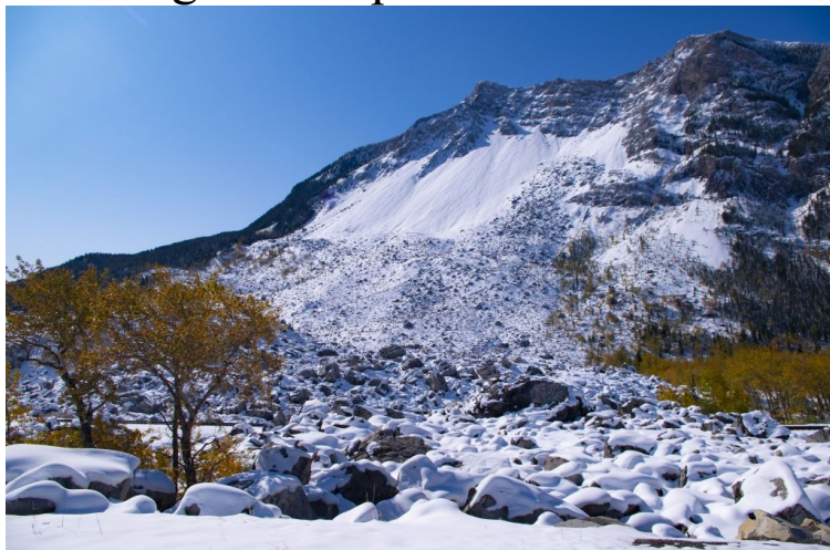
Frank Slide SW Alberta. https://en.wikipedia.org/wiki/Frank_Slide