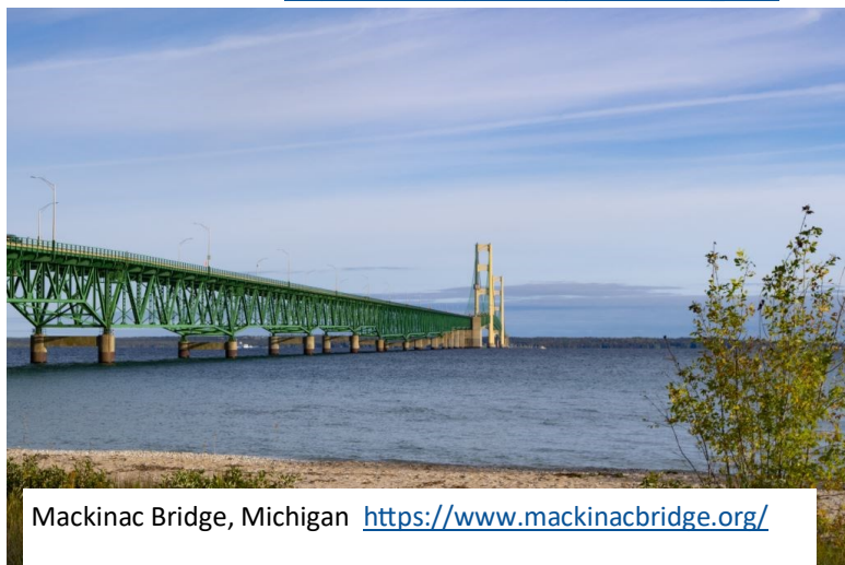
Mackinac Bridge, Michigan https://www.mackinacbridge.org/