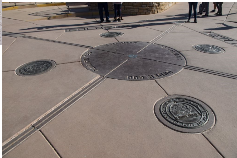
Four Corners: New Mexico, Arizona, Utah, Colorado https://en.wikipedia.org/wiki/Four_Corners