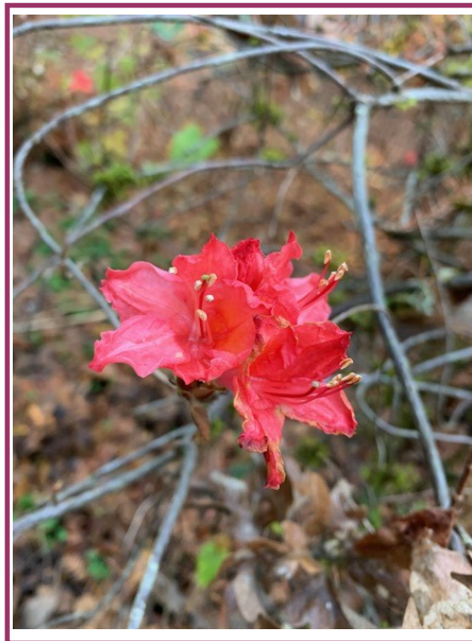
A Hendricks Park Winter Bloom

Registration forms are available as an insert in the Winter (January distribution) quarterly edition of Journal American Rhododendron Society .