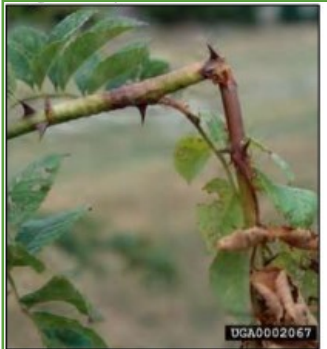
Fig.2 - Larvae of Agrilus cuprescens, weaken the cane which may break spontaneously.

(Editor's Note: This brief, paraphrased article and the accompanying photographs are excerpted from the following sources: