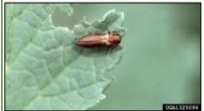
Fig.1 - Damage to caneberry foliage by adult rose stem girdlers, Agrilus cuprescens , is typically minor.

Management of rose stem girdler in Oregon is currently limited to cultural methods. Plant in well-drained soil and provide adequate water and fertilizer to avoid plant stress. When telltale enlargements are seen on the canes, remove them by pruning below the damage, then destroy the prunings.