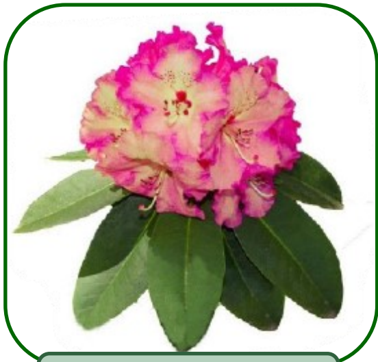
A truss from R. 'Harold Greer'