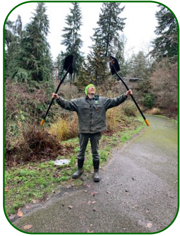
Check out these before and after photographs . . .