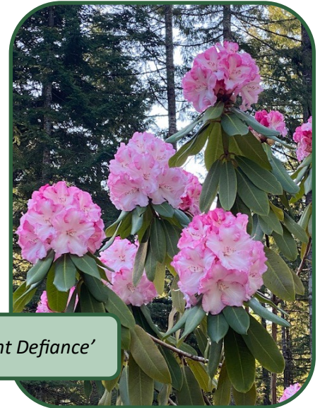
'R. Point Defiance'