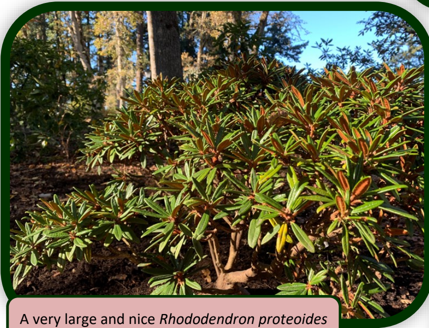
A very large and nice Rhododendron proteoides in its new home in the Greer Bed.

Otherwise, come and visit us at Hendricks Park and enjoy some new plantings.