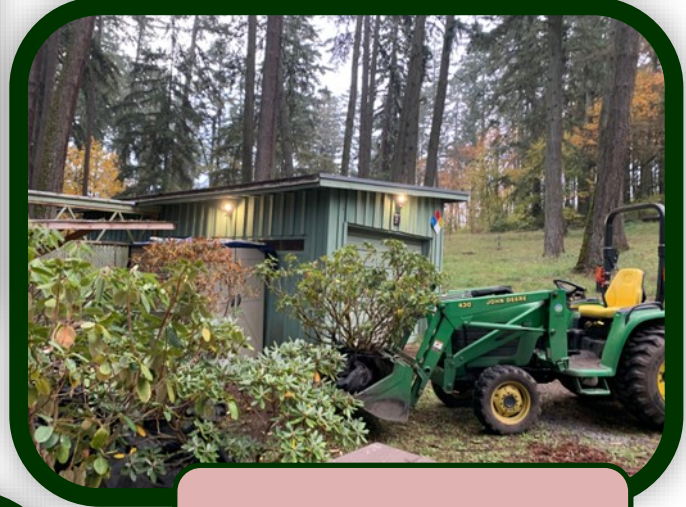
For scale - here's a look at how big the large plants were!