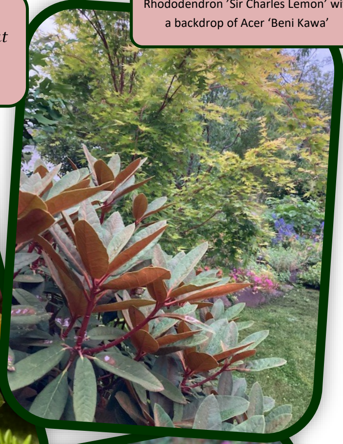
Rhododendron 'Sir Charles Lemon' with a backdrop of Acer 'Beni Kawa'