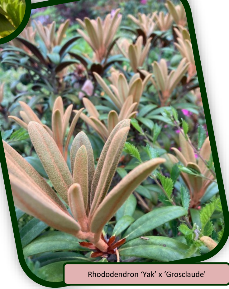
Rhododendron 'Yak' x 'Grosclaude'