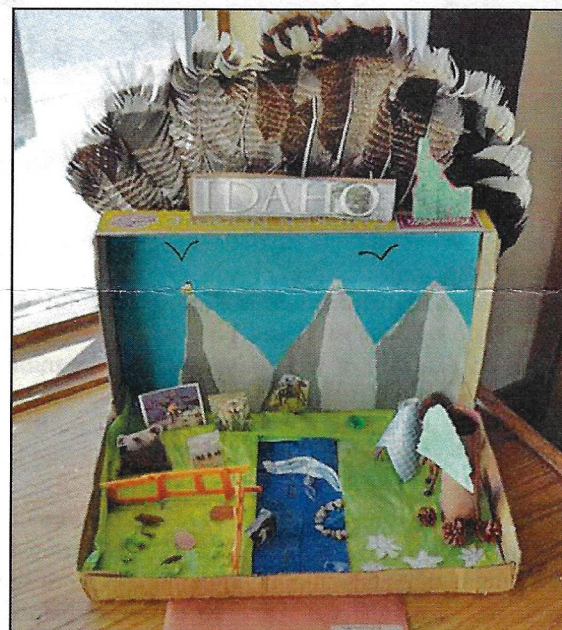
One of the many creations from the 2022 Beautiful Dreamers show.