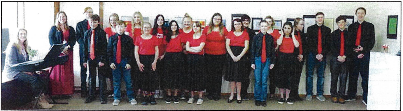
The Challis Jr. Sr. High School choir performed for the opening of last winter's Young Artist Show.