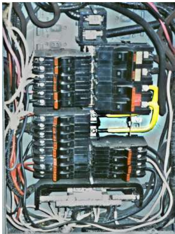
Figure 3 – Split Bus Panel

Prior to 1984, many manufacturers offered “split bus” panels for residential use, such as the panel in figure 3. These panels have no main breaker. They do meet the rule requiring no more than 6 disconnects, and one of these disconnects feeds a separate bus that typically contains the 15 and 20 amp 120 volt circuits. The advantages of a split bus panel were purely economic. If the largest breaker was the one feeding the secondary bus, and it was rated at 50 amps, it cost less than a single main 100 amp breaker. In addition to the “six disconnects” rule for service equipment, another rule also applies to panels that are categorized as “lighting and appliance” panels. These are panels where more than 10% of the breakers are rated 30 amps or less and serve circuits with neutrals. These lighting and appliance panels must be capable of having their power disconnected by not more than 2 hand movements. Until 1984, the code exempted these panels from the “two-disconnects” rule when they served as residential service equipment. Today, the code allows them to remain when they are “existing” service equipment, though it would not allow a new installation of such a panel.