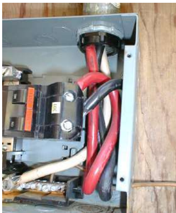
Figure 1 – Insufficient wire bending space

Several of the problems found with FPE panels are found in other brands of equipment of the same age. There is less gutter space in the panel than we find in modern equipment. The result is crowding of the wires in the panels. It is sometimes impossible to see all of the terminals in an FPE panel. The space for bending wires is also less than required in modern panels. The rules that proscribe minimum wire bending space are found in the National Electrical Code (NEC) in section 312.6 in the 2002 edition. Over the years, the required minimum space has increased, with the most significant changes in the 1981 NEC, near the very end of the days when FPE panels were made. FPE manufactured some panels with less clearance than the minimum code rules by installing the lugs at an angle, so the conductor was already parallel to the wall opposite the breaker terminal (figure 1). However, the bends shown in figure 1 defeat the purpose of the angled lugs, and the wire is bent too sharply.