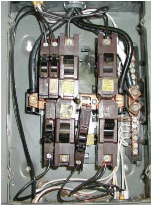
Figure 9 – Loose breaker

Not only do “E” breakers make poor connection to “F” sockets, forcing them into the socket can damage them. The breaker may split when shoved into the slot, with the bus stab receding inside the breaker (figure 7). Since it is now making a very loose contact to the bus, the breaker might fall right out when the deadfront cover is removed (figure 9). Inspectors can be forewarned of this condition before taking off the cover. Simply look at the label for the panel to see where the “E” slots are located and whether any “E” breakers have been inserted into “F” slots. When finding that situation, there is no need to remove the cover to know that the breaker is in the wrong position.