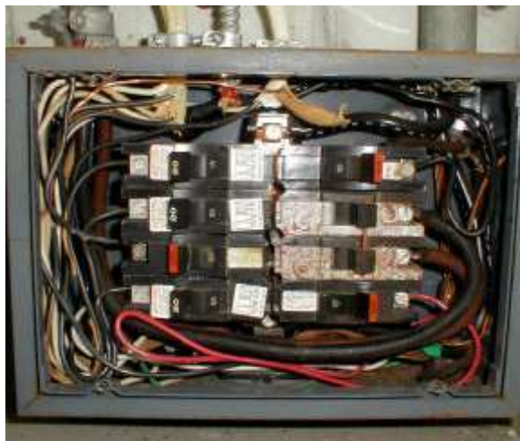
Figure 4 – Overcrowded FPE panel with wires obscuring terminals, neutral bar, and bonding jumper. If the wires press against the deadfront, it may pop out and trip the breaker handles as soon as the panel screws are removed.

There are at least 5 design issues that are no longer allowed by code; the gutter space, the wire bending space, spring-mounted bus, breakers that are on when down, and the split bus service equipment. These issues mean that a panel that has been sitting on the hardware store shelf for 20 years would not meet today's code, despite the UL listing of the panel at the time it was manufactured. Another even greater concern is that older breakers – of any brand – do not become more reliable with age. The internal mechanical components can become corroded or distorted, and the springs, hinges, and levers inside the breaker might not operate as designed after sufficient passage of time. Most breaker manufacturers guarantee their products for only a year, and for valuation purposes breakers are considered fully depreciated after 15 years.