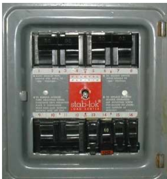
Figure 2 – Breakers that are on when down

Since the 1984 edition of the NEC, breakers that operate with their handles in a vertical position must be on when in the up position, and off in the down position. Prior to that time, several manufacturers made equipment such as that seen in figure 2, with a row of breakers that was on when down and off when up. The word “on” when upside down is “no.” Inspectors encountering such equipment might want to warn their clients that these FPE breakers are on when facing the outer edge of the panel, and off when facing the center of the panel. It can be very difficult to remove these covers without accidentally tripping a breaker.