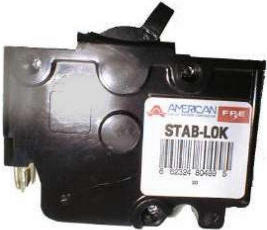
Figure 10 – Replacement Stablok breaker

Another consideration is the desire to install GFCI or AFCI breakers. GFCI breakers can sometimes be found in the specialty supply houses, and they are very expensive. Since GFCI protection can also be provided by receptacle outlets and other feed-through devices, the lack of available GFCI breakers is not a major issue. As of this writing, no listed AFCI breakers are available for FPE panels.