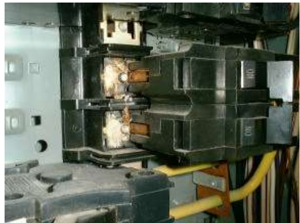
Figure 5 – Scorched Bus Bar

Inspectors might find that their first problem with FPE is the difficulty in removing the deadfront cover without tripping the breakers. Several models of FPE panels have breakers that are on when the handle is positioned toward the outside of the panels. The handles stick out slightly over the deadfront, past the twist-out opening for the breaker. To remove the cover, it is necessary to first lift it slightly away from the panel, then slide it under the handles of one row while lifting the cover off the other row. If an inspector pulls the cover straight off, it is likely that some of the breakers will accidentally trip. The panels in figures 2, 3, and 4 have this problem.