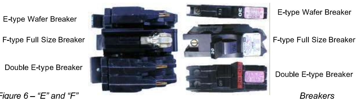
Figure 6 – “E” and “F”