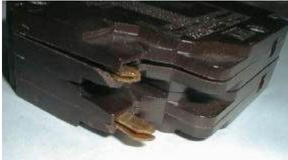
Figure 8 – Damaged “E” type breaker

Not only do “E” breakers make poor connection to “F” sockets, forcing them into the socket can damage them. The breaker may split when shoved into the slot, with the bus stab receding inside the breaker (figure 7). Since it is now making a very loose contact to the bus, the breaker might fall right out when the deadfront cover is removed (figure 9). Inspectors can be forewarned of this condition before taking off the cover. Simply look at the label for the panel to see where the “E” slots are located and whether any “E” breakers have been inserted into “F” slots. When finding that situation, there is no need to remove the cover to know that the breaker is in the wrong position.