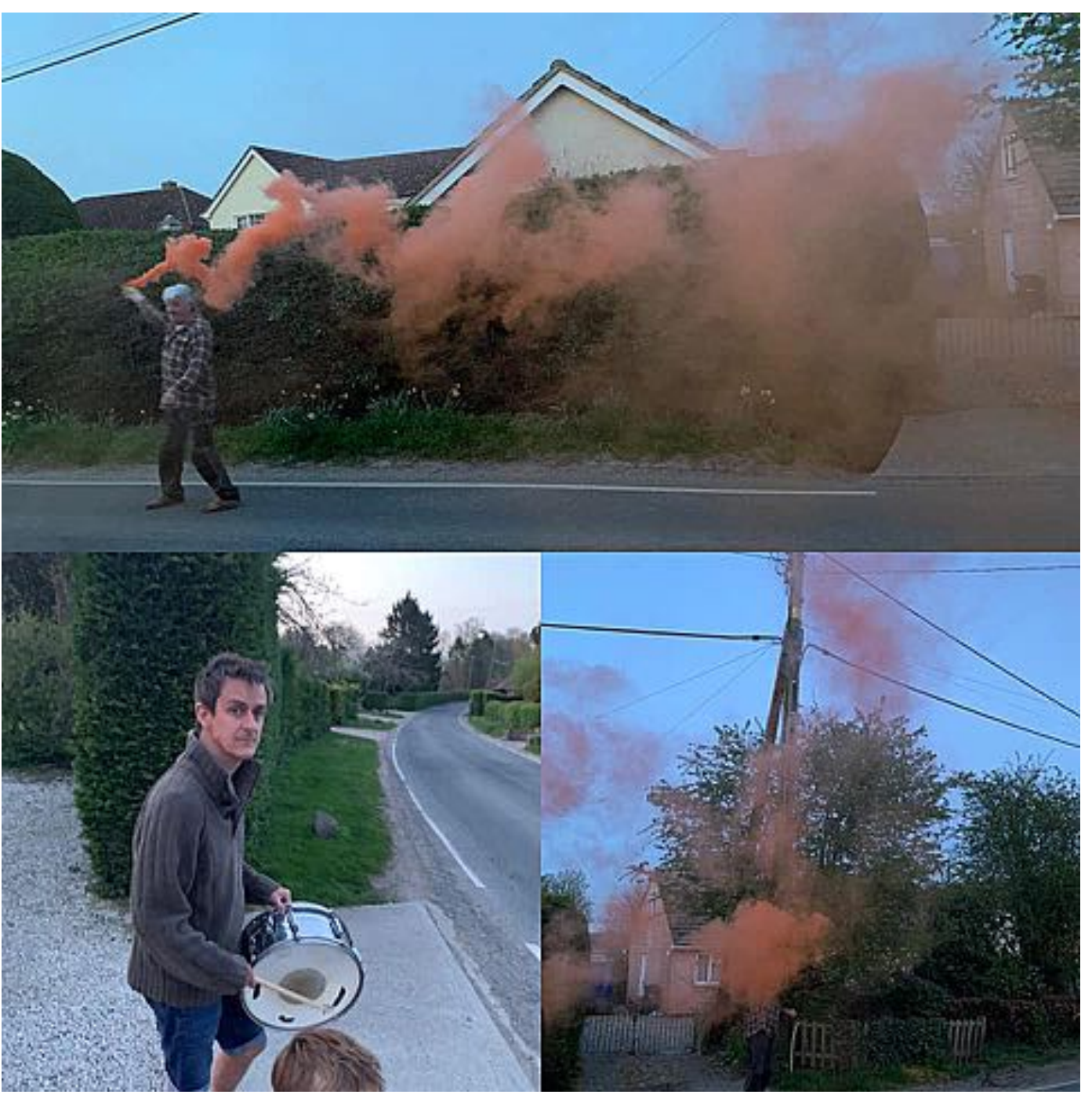
Stay Home - Stay Safe - Keep Well.

Clap for the NHS continues to bring together the residents of Gestingthorpe with drums, pans, smoke flares or hands - being an elongated village along single roads means we have to make a little more noise than some in order for some neighbours to hear us.