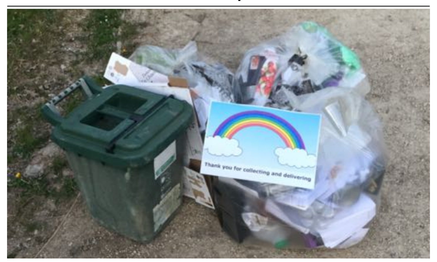
Thanks to our deliverers and collectors