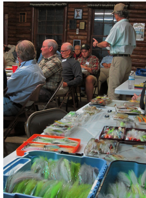
Lesson #1 – You never have enough flies