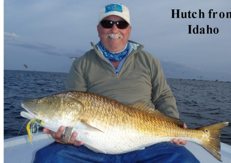
Hutch from Idaho