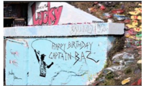
The Graffiti (17 th Street) Bridge