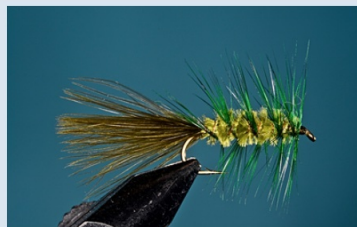
Woolly Bugger (Click to view)