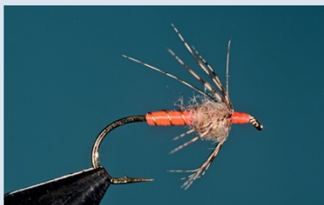
Partridge and Orange Soft Hackle Wet Fly (Click to view)