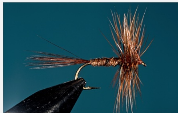
Pheasant Tail Variant Dry Fly (Click to view)