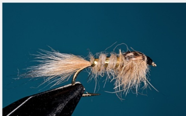
Gold Ribbed Hare's Ear Nymph (Click to view)

https://flyfishersinternational.org/Tying/Fly-Tying-Skills-Award-Program/Bronze-Award .