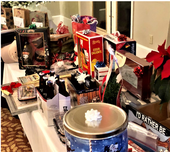
Thanks to all who donated door prizes.