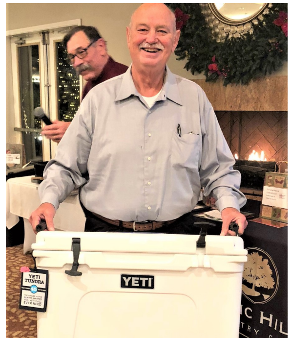
That's a really cool prize