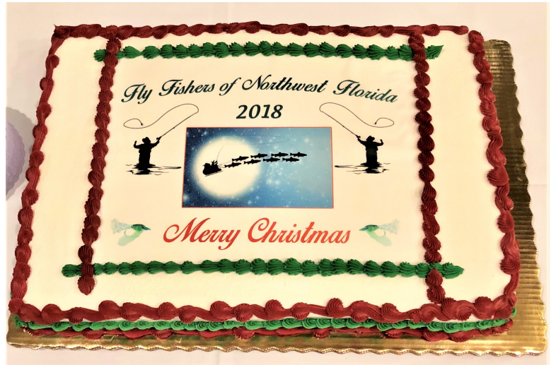
Too Pretty to eat!