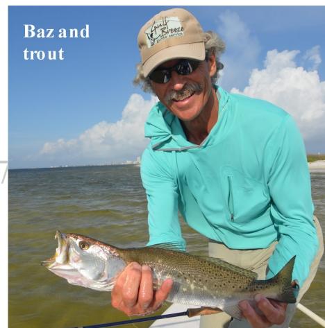
Baz and trout