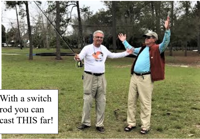
With a switch rod you can cast THIS far!