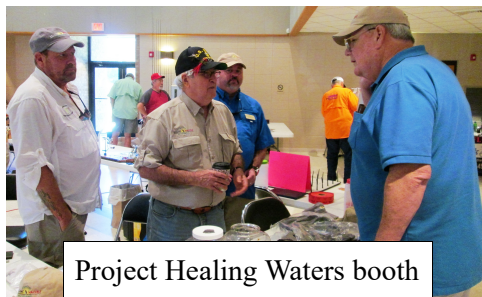
Project Healing Waters booth