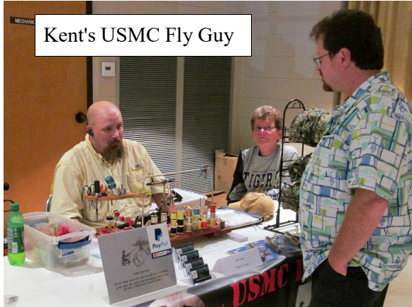
Kent's USMC Fly Guy