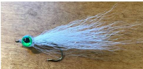
Finished fly ready to fish

Then came the bucktail. I tried everything else I could get ahold of, especially variations of craft fur, calf tail, synthetics, but always came back to bucktail. The real challenge was keeping the hair really sparse. I remember reading somewhere that Bob Clouser doesn't sell the flies he fishes because no one would buy them. They look too skimpy to people used to the fancy flies they see in the catalogs. The real secret is that sparse skimpy flies don't have buoyancy, and that makes up for the lack of weight. I would tie a fly, go try it out, and inevitably end up trimming off more hair.