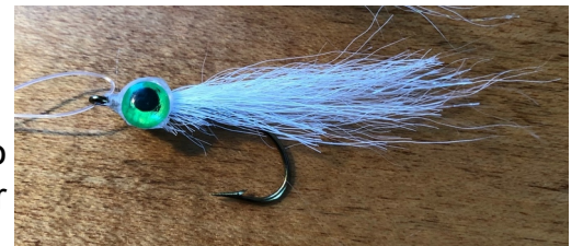
Trimmed after I got it to the water

Here in Michigan at our seawall we have about 5 feet of crystal clear water. There are perch, small bass and occasionally a small pike right at my feet. I could not only watch the fly – I could watch the fish. Here are a couple of things I could see: