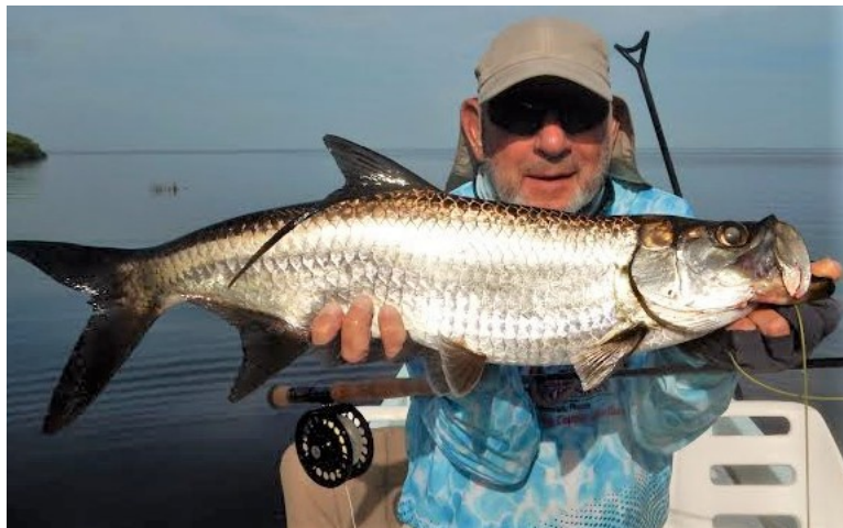
Baby Tarpon – aren't they called Poor Man's Ladyfish?