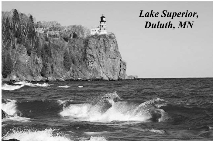
Lake Superior, Duluth, MN