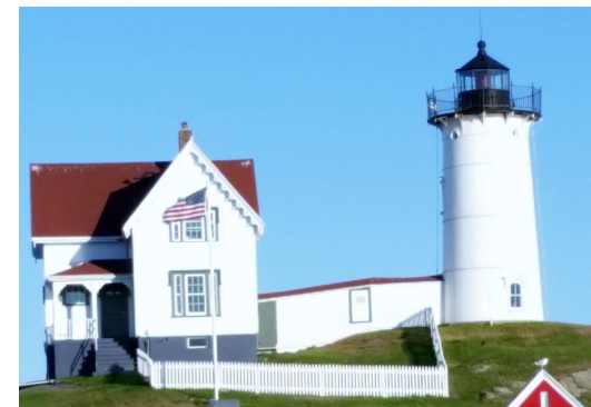
Nubble Lighthouse, Cape Neddick

Including Niagara Falls, New York City and Boston