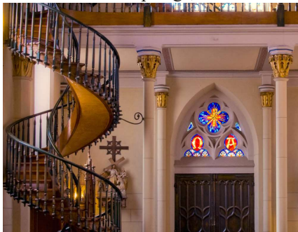
LORETTO CHAPEL, SANTA FE

This morning, we'll have a short drive to the Spanish town, Santa Fe, the capitol of the state of New Mexico. A multiplicity of cultures, Native American Indian, Spanish, Mexican and Anglo, provide a rich and very colorful heritage. You will marvel at the Loretto Chapel , home of the miraculous staircase sometimes referred to as St. Joseph's Staircase. Puzzling architects and engineers, the mysterious staircase makes over two complete 360 degree turns, stands 20 feet tall, has no center support and rests solely on its base and against the choir loft. Our overnight accommodations will be at the Hampton Inn of Colorado Springs, CO.