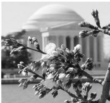
Our Nation's Capitol enclosed by the beautiful cherry blossoms