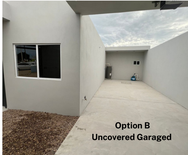
Option B Uncovered Garaged