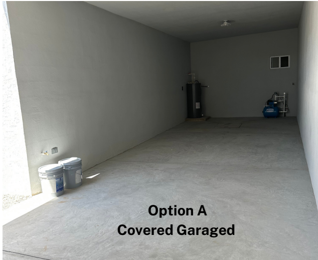
Option A Covered Garaged