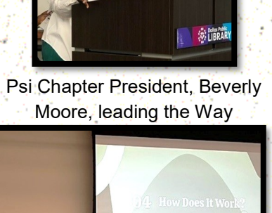
Soror Young presenting