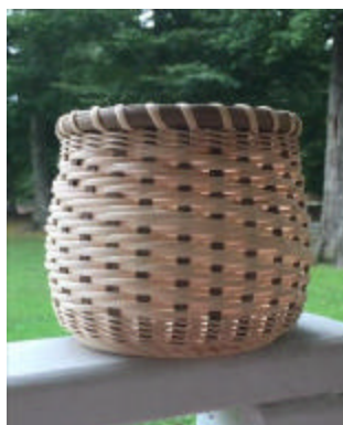
Sybill Magrill's beautiful Spiral Smoke basket woven at the September meeting.

Thank you Sybil for your service aboard the USNS Comfort!