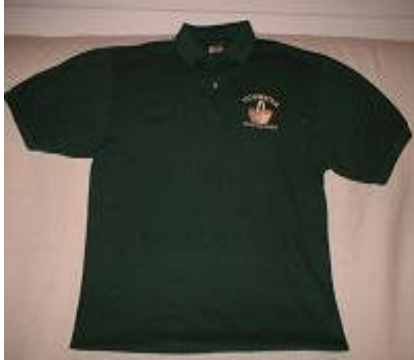
Crew shirt short sleeve with collar. Available in Green and Sandstone. Sm, Med, Lg, XL $23.00 XXL $26.00, XXXL $29.00

T-shirt order.. If you have placed an order, the shirts will be in very soon. If you still need to order please contact Linda Lindner today. Vicepresident@tidewaterbasketryguild.org