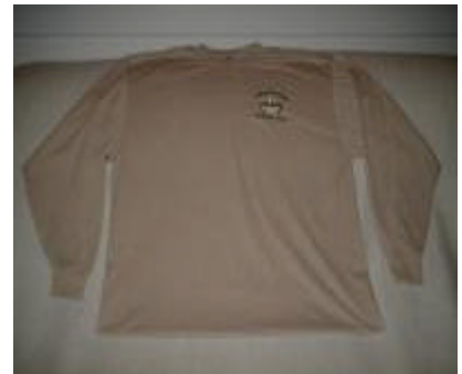
Long sleeve t-shirt. Available in Green and Sandstone. Sm, Med, Lg, XL $20.00 XXL $23.00, XXXL $26.00