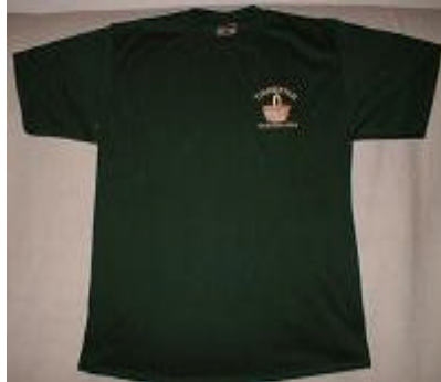
Short sleeve t-shirt. Available in Green and Sandstone. Sm, Med, Lg, XL $18.00 XXL $20.00, XXXL $22.00