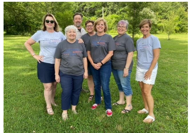
Making new friendships is one of the awesome things that happen when you are weaving.

The setting was very peaceful and relaxing in the mountains of Tennessee. They even have a lovely porch attached to his workshop and when the weather is permitting you can sit out on the porch to weave or sand a project.