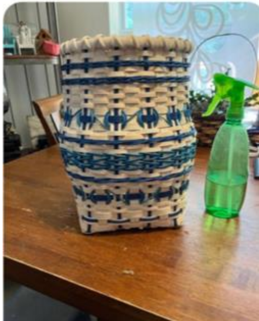
Cherokee Sampler Basket