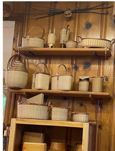
Some of the baskets you had to choose from!