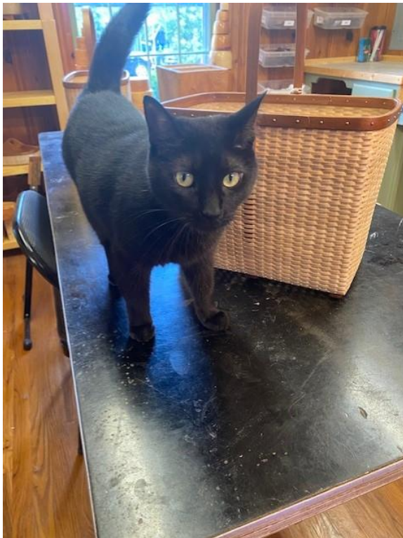
I think she is also quality control over finished basket's