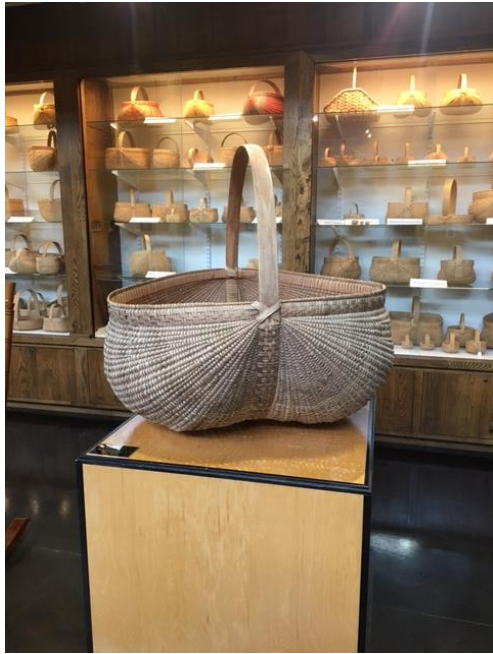
This basket was too large to fit in this basket makers home, he donated it to the museum.