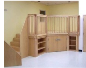
Teen College/Career Center, Chicago, IL

Chicago Youth Symphony Orchestra – programming and feasibility design of new facility, - with Marwen Foundation and Chicago Youth Center for the Arts