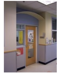
Kids' World Child Development Center