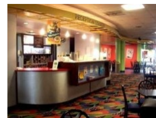
Rynish Bowling Center