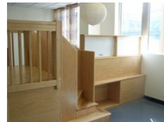
New City Child Development Center West Humboldt Park Early Head Start