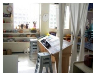
Nia Family Center - Recipient of Chicago Building Council's "Best New Building Under $5 Million" Award - in association with IFF