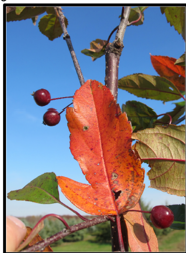
LEAF & FRUIT FALL