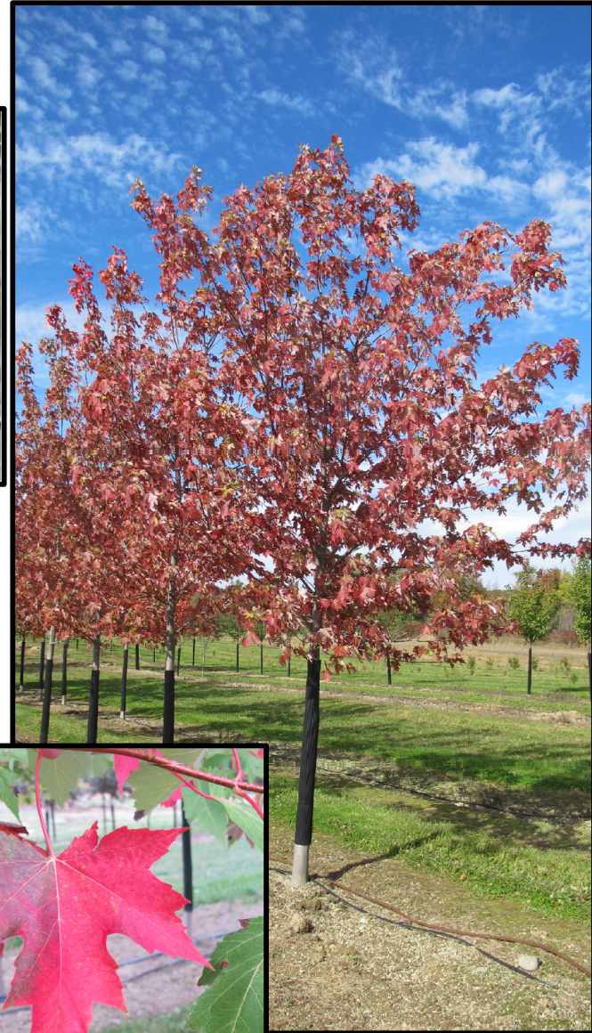
LEAF - FALL