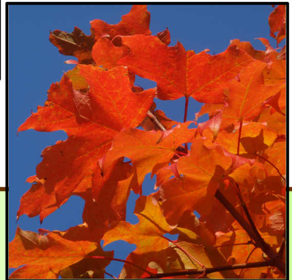
LEAF - FALL

CULTURE: Prefers moist well drained oil - sandy loams. Poor resistance to salt. Roots may lift sidewalks. It offers a dense canopy of dark green leaves, producing dark shade. The tree is strong, and if trained properly will not succumb to wind or ice. This is also the same tree that maple syrup is collected from. So long as the soil and full sun conditions are met, this will be a solid performer.