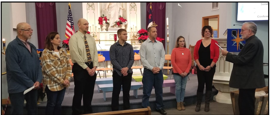
December 17, installation of new council members for 2024.

09/30/2023 Balance $16562.36 Interest 9/24/2023 $62.29 09/30/2023 New Balance $16,624.65