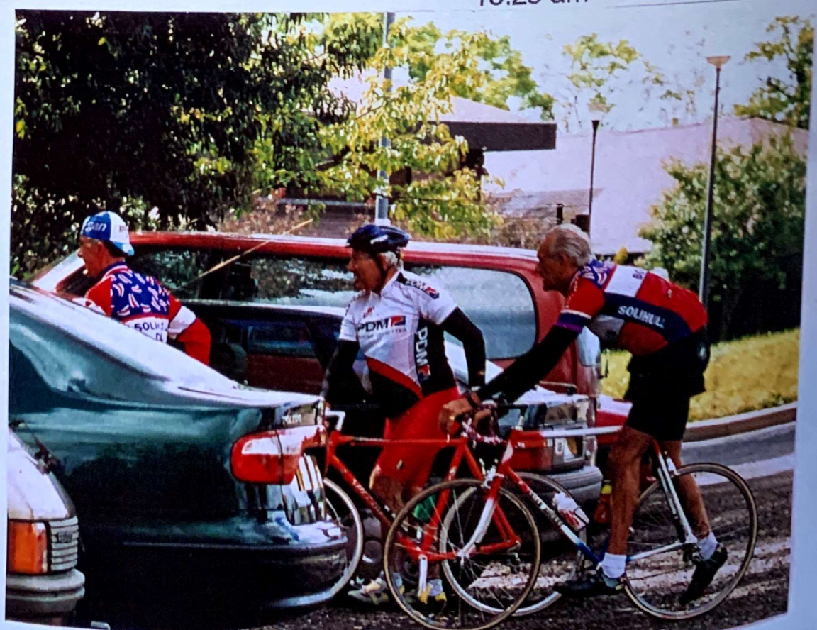
10.29 am - Executive Run.