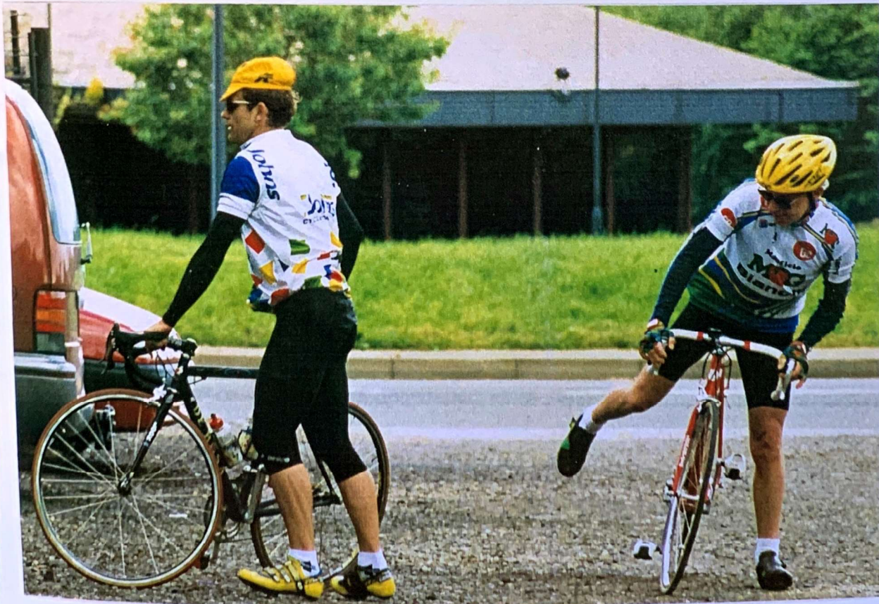
10.29.45 am – from across the Globe, still they come !