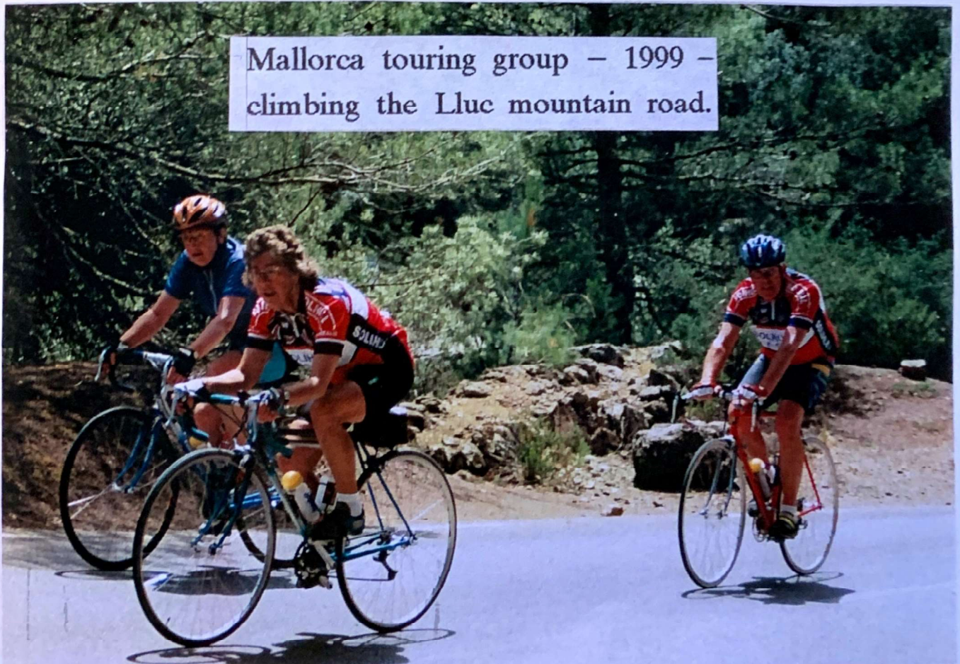
Mallorca touring group – 1999 – climbing the Lluc mountain road.