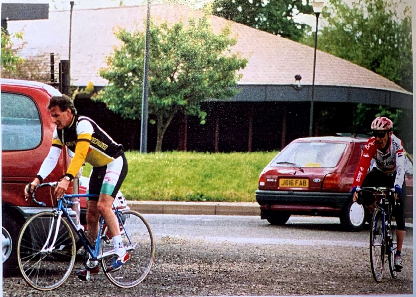
10.29.50 am – more hardmen .....