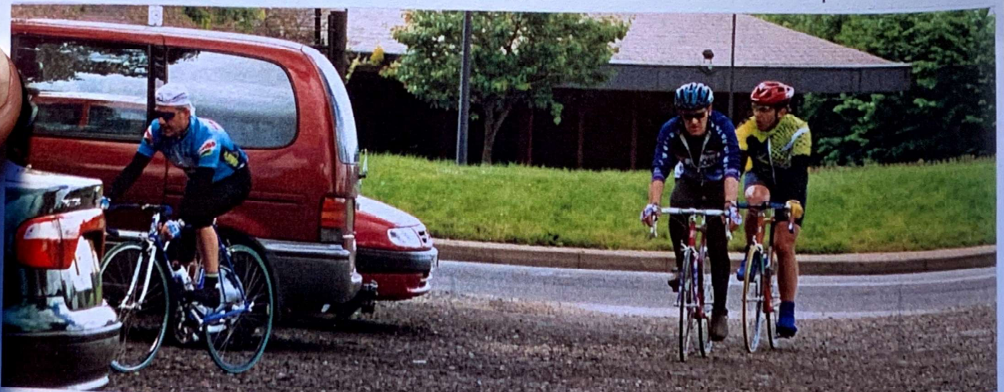
10.29.58 am – The Cream ..... spot on time!