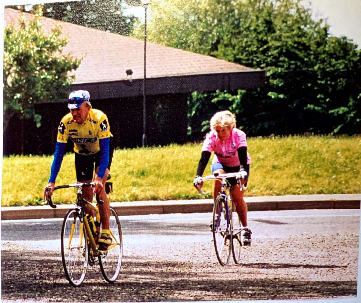
10.28 am - Vanguard duet.