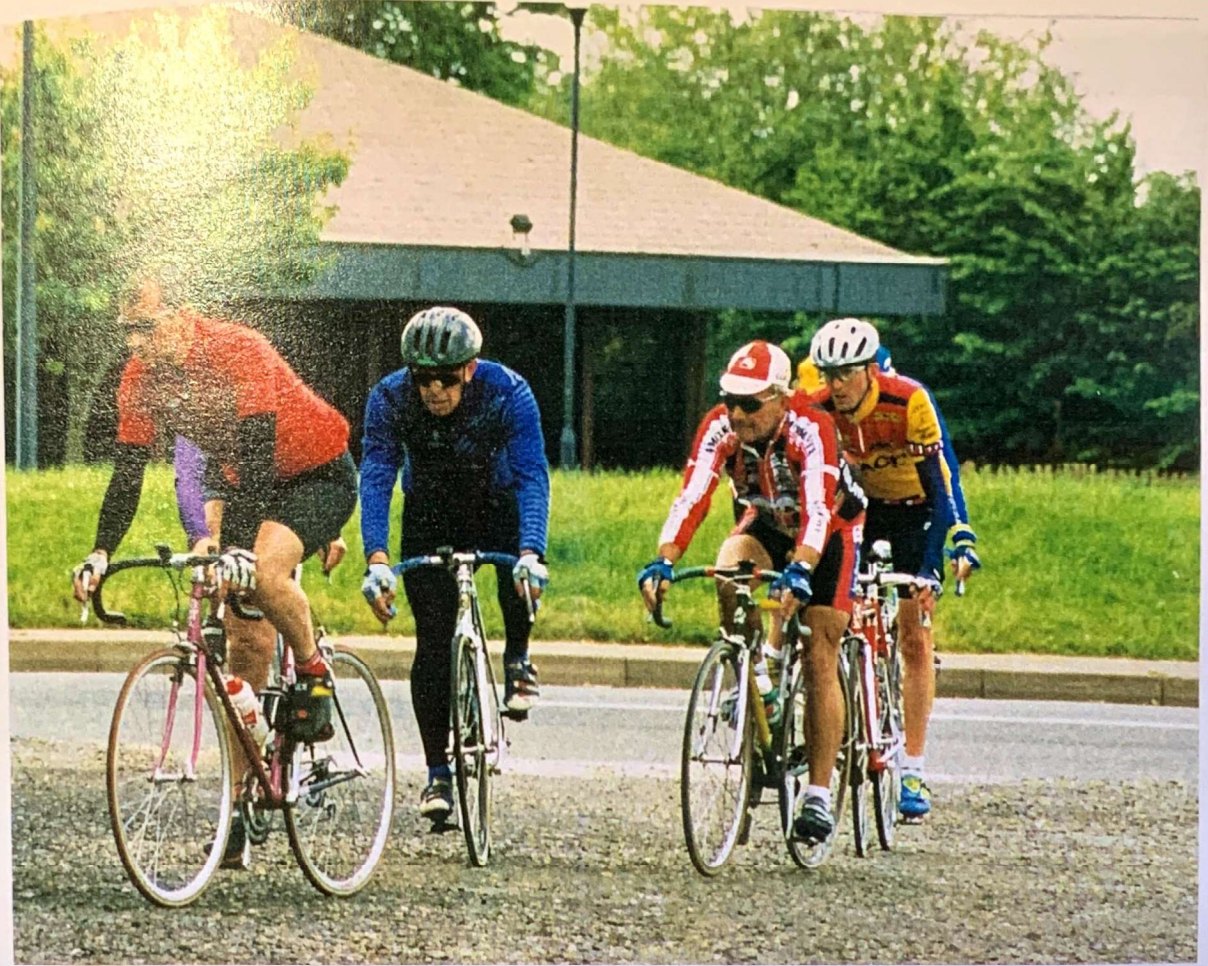
10.29.40 am – Peloton Fastpack.