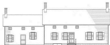
JACOBUS VANDERVEER HOUSE & MUSEUM BEDMINSTER, NEW JERSEY