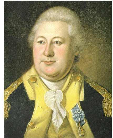
General Henry Knox (1750-1806)

During the winter of 1778-79, the Jacobus Vanderveer House was the home and headquarters of General Henry Knox, who commanded a military training academy in Pluckemin. The 1772 Dutch Colonial home is the only surviving structure associated with the Pluckemin Artillery Cantonment, considered America's first military training academy and a precursor to the United States Military Academy at West Point.